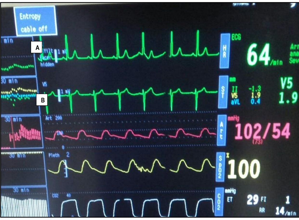
Fig.1.A and B showing rhythm in lead 11 and V5 respectively along with invasive blood pressuring tracing and saturation and capnographic wave form during the period without use of cautery.