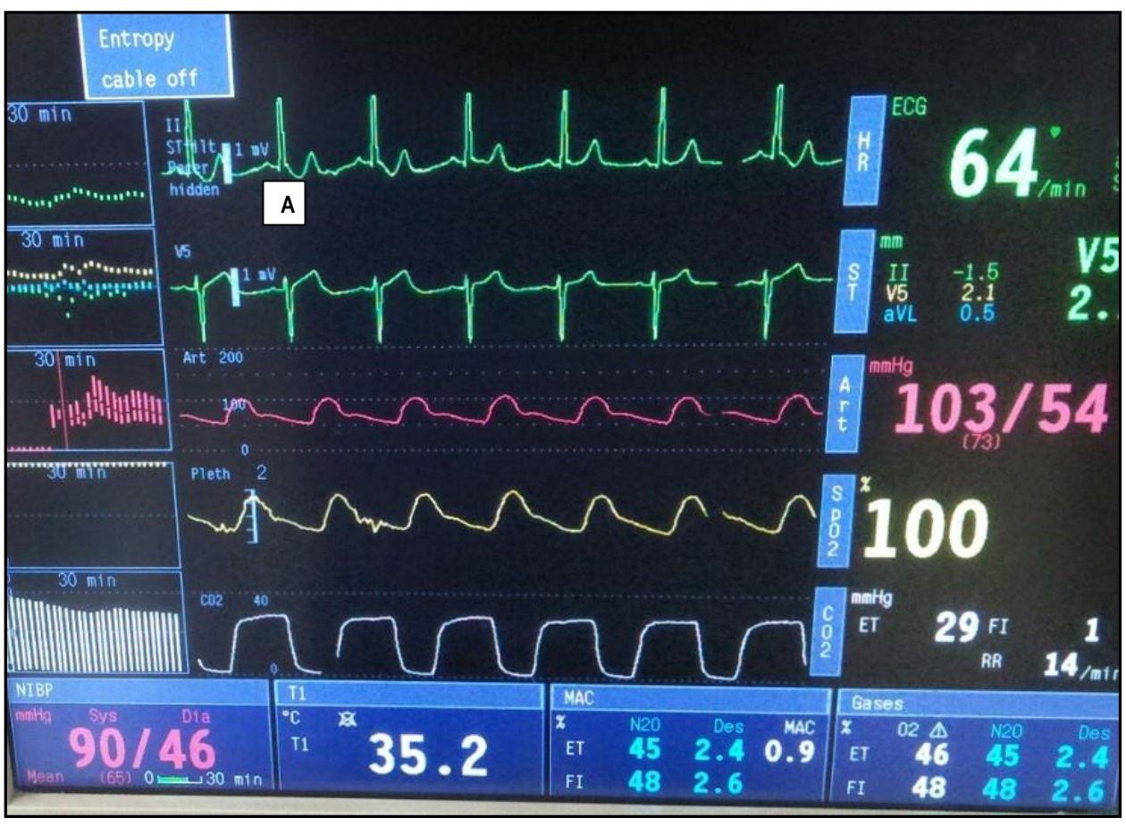
Fig.2: Showing ECG having ST wave changes in lead 11